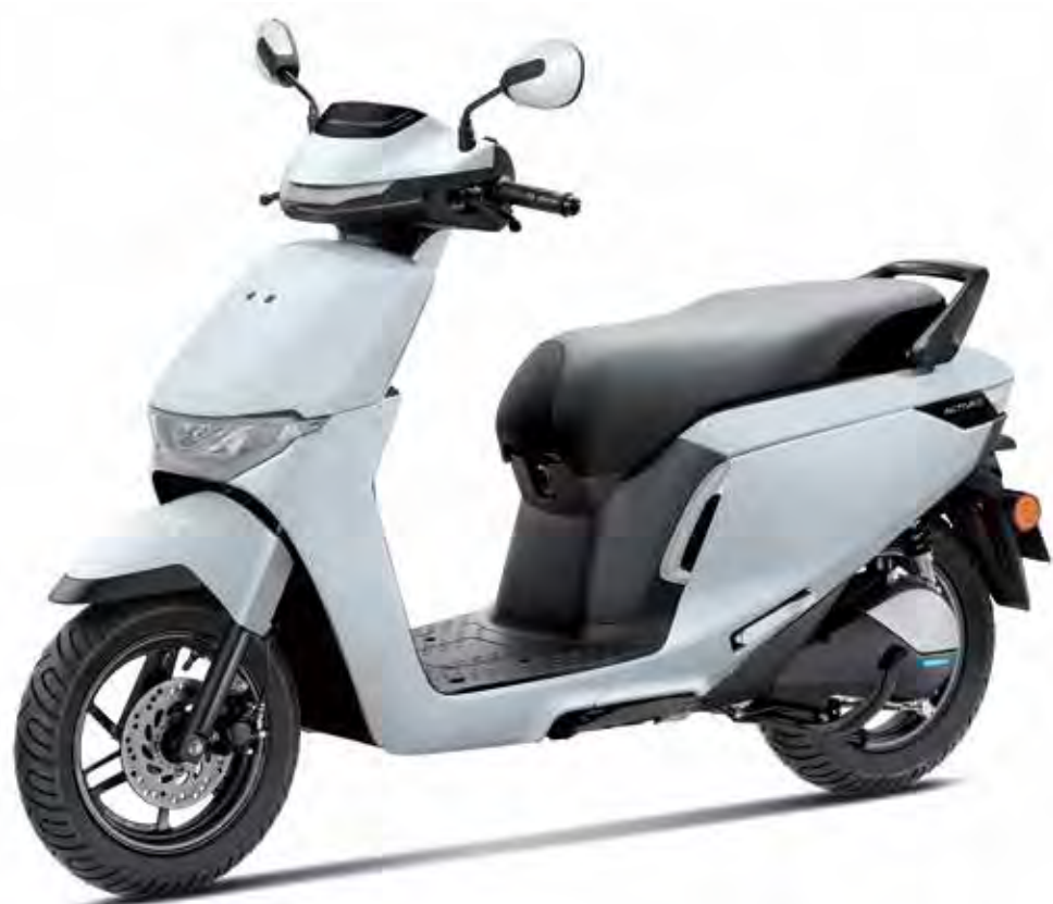
Pearl Misty White

*Products shown in the pictures may vary from actual products available in the market. All features and colours may not be part of all variants. Accessories shown in the pictures are not part of standard equipment. For creative visualisation only.