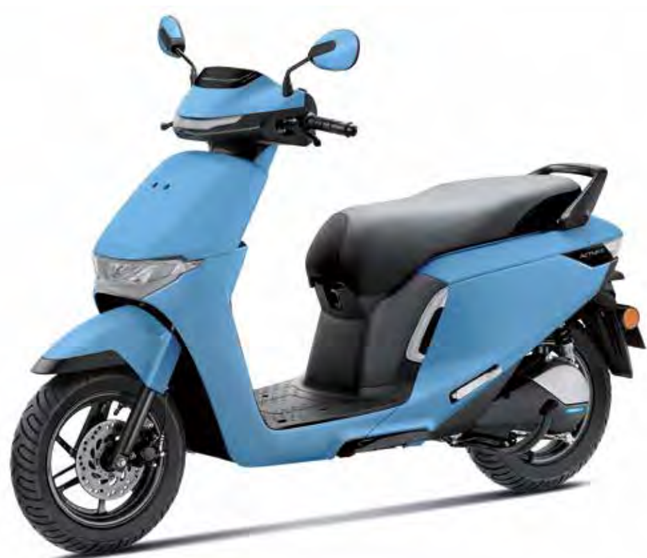
Pearl Serenity Blue